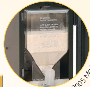
PIC 1 - 2005 Model

Large (6.5 lb/3 kg) Clear View™ hoppers require less frequent filling.