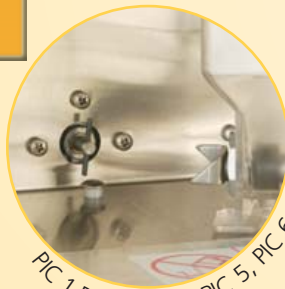
PIC 1, PIC 2, PIC 3, PIC 5, PIC 6

Self-aligning pin & link hopper drive for durability and easy install.