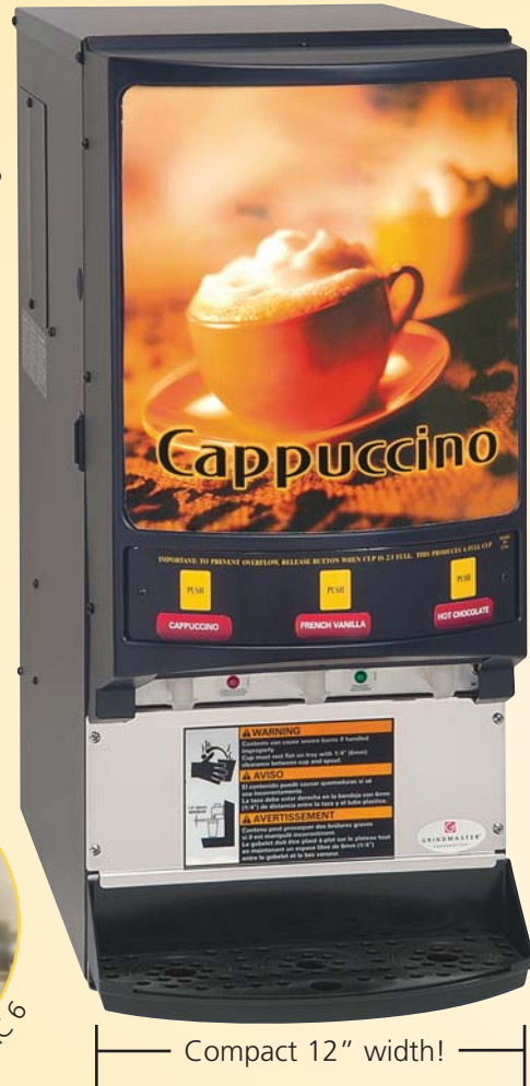
Compact 12" width!