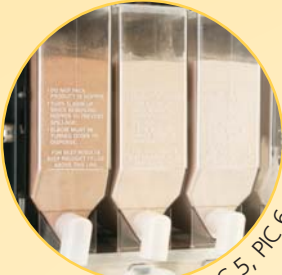
PIC 2, PIC 3, PIC 5, PIC 6

Large (5 lb/2.25 kg), Clear View™ hoppers for fast product level visibility.