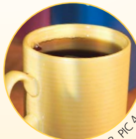
PIC 2, PIC 3, PIC 4, PIC 5, PIC 6

Optional 2500 Watt heater offers extra quick recovery for added capacity.