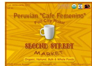
Examples of private labels