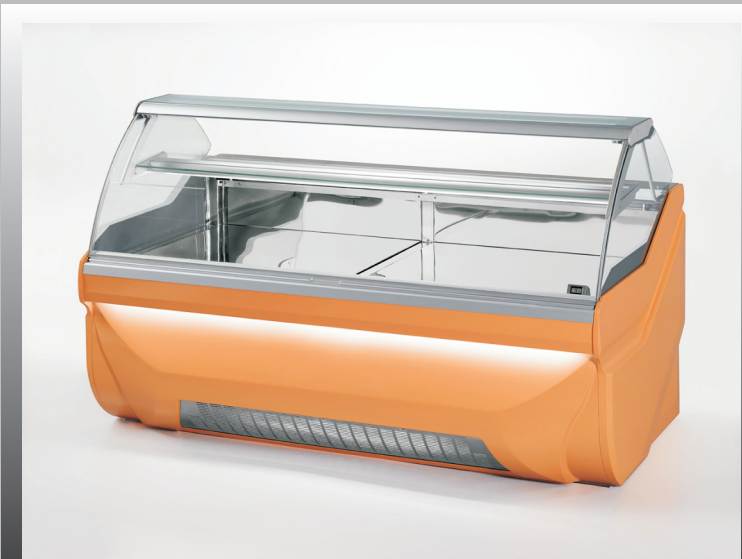
AMIKA IN PASTRY 161 - Peach