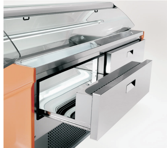
Pull out drawers - Option